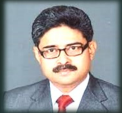
Sr. Adv. Pradeep Rai

Former Acting Chief Justice of Hon'ble Patna High Court and Hon'ble Andhra High Court